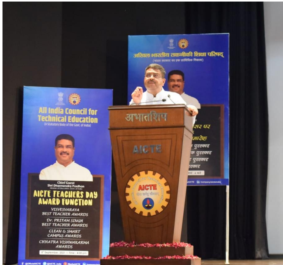
Awards conferred on outstanding faculty members and innovative students by Union Minister of Education Shri Dharmendra Pradhan along with Minister of State for Education, Dr. Rajkumar Ranjan Singh on 05 Sep 2021 on the occasion of Teacher's Day.