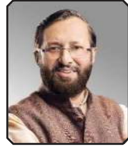
Prakash Javadekar Minister of Human Resource Development Government of India